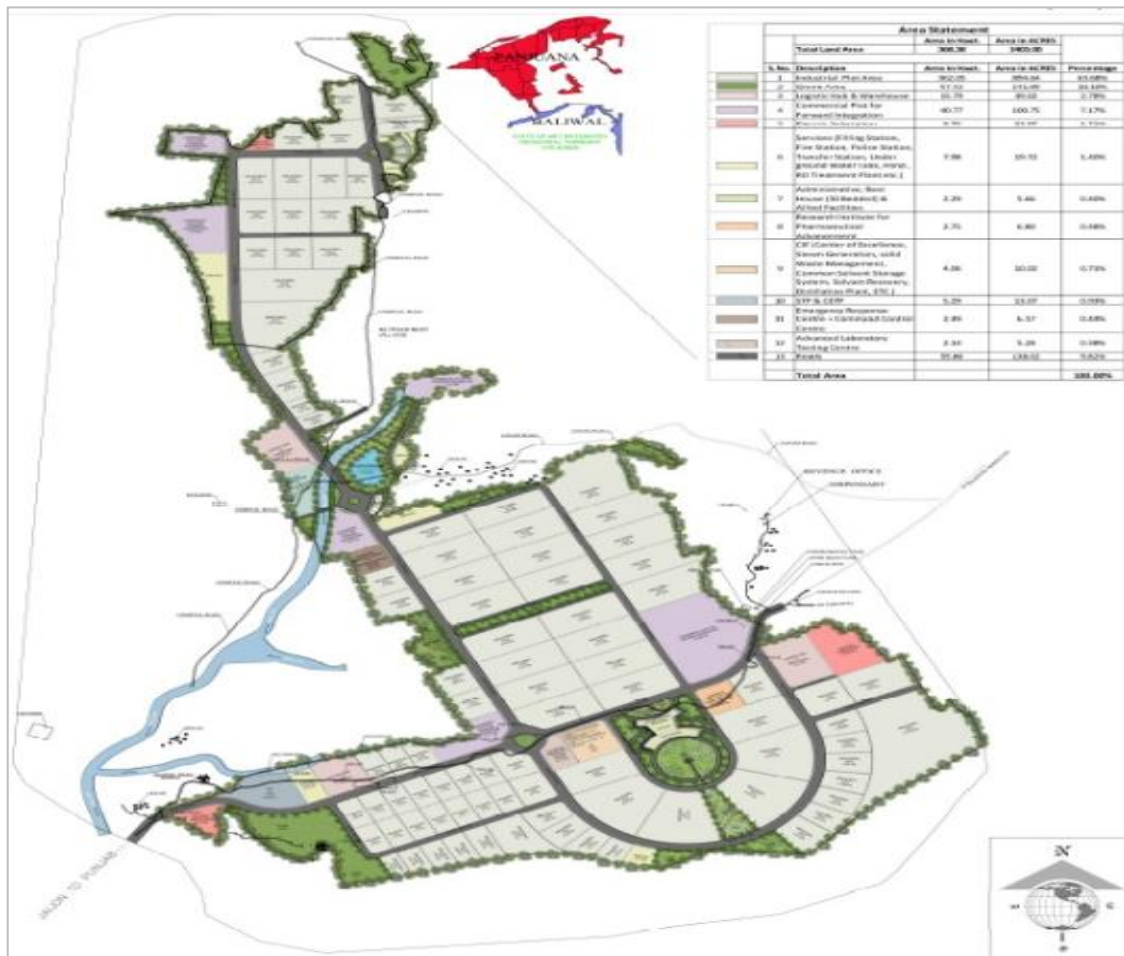
Tentative Conceptual -Layout Plan and use area Statement as per DPR